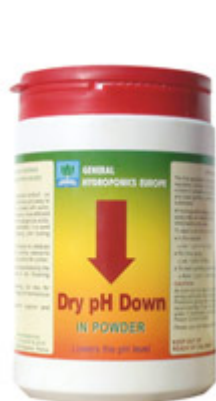
pH Down Sec

For all growing methods: hydroponics and soil